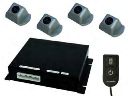
Includes: 5m, 10m, 10m & 18m cables.

*Not including installation, or any additional cables (+VAT).