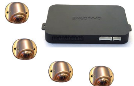
Includes: 5m, 10m, 10m & 15m cables.

Digital Wireless Transmitter & Receiver, also available for caravan/trailer use @ £100.